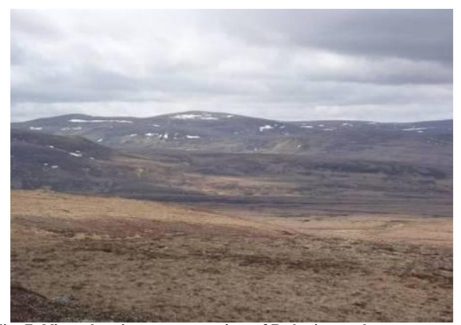
Fig. 7- View showing upper section of Dulnain catchment