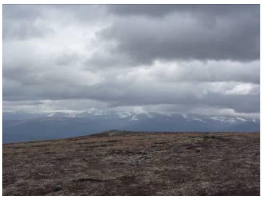
Fig. 6- View towards Cairngorms from Park boundary near site.

6. The wind farm comprises 31 wind turbines with an anticipated maximum capacity of 3MW each. The maximum height would be 125m to the blade tip.